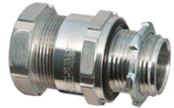
TC Cable Gland shown as example